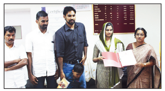
License agreement with M/s Mannil Spices

It also participated in PLACROSYM 22–"Leveraging Innovation system in Plantation sector through value addition" during 15-17 December 2016 at ICAR-CPCRI, Kasaragod and conducted sales of incubatee products and technologies developed by ICAR-IISR.