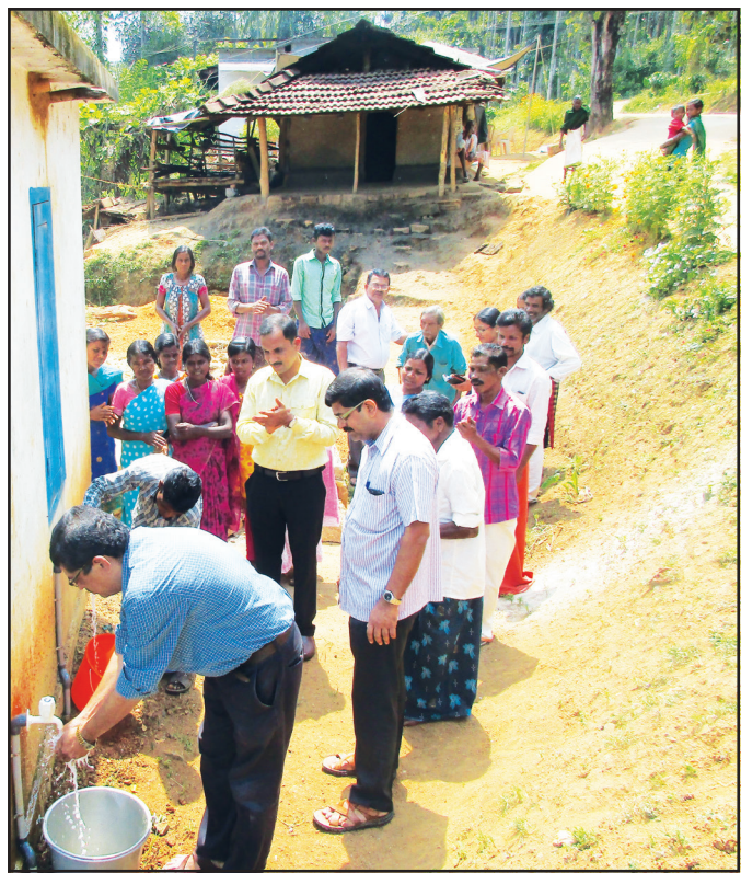
The water distribution tap installed in Kuzhimukk tribal colony